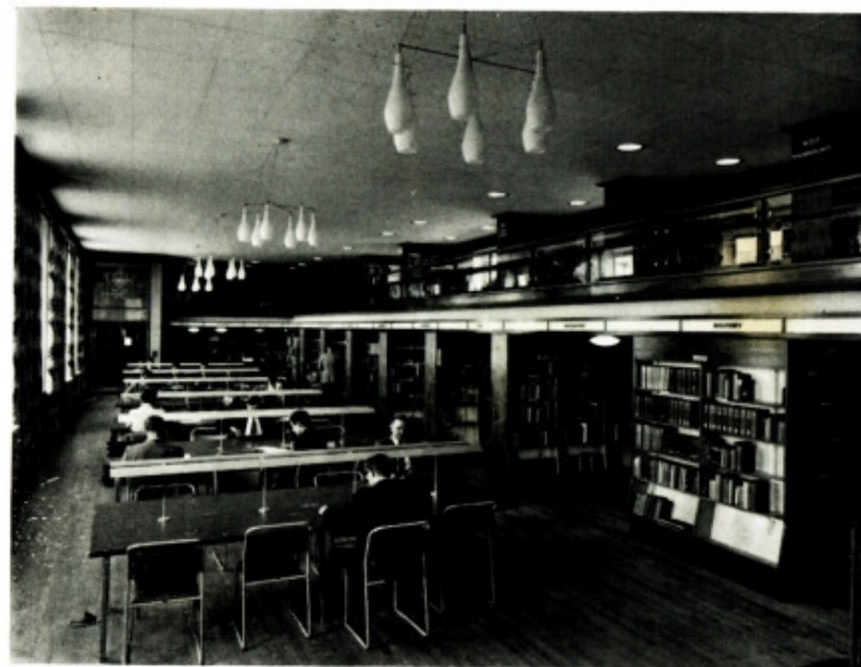
PART OF THE LIBRARY