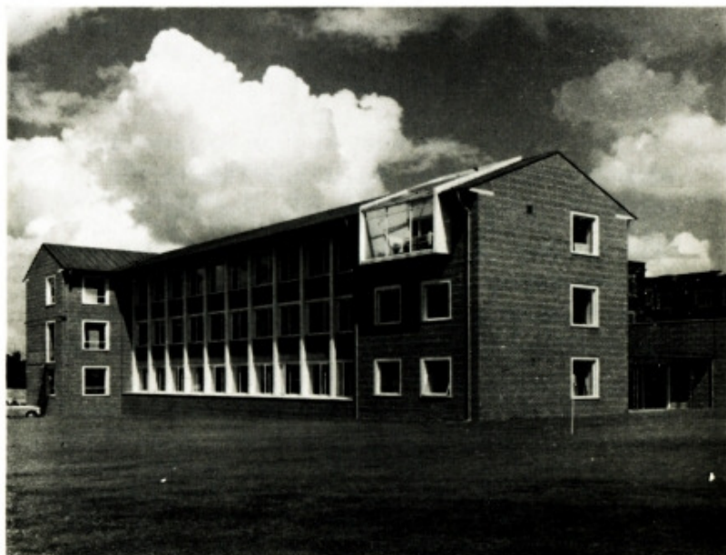
THE SCIENCE WING

There are facilities for the following activities : Rugby and Association Football, Cricket, Hockey, Athletics, Swimming, Water Polo, Cross-Country Running, Rowing, Tennis, Judo, Badminton, Basketball, Fencing, Camping, Scouting, Sailing, and Folk dancing. In each of the major games three or four teams have full fixture lists. The standard of games is very high. First teams play university and leading club sides, and second, third and fourth teams have fixtures with smaller clubs and schools. The Rugby 1st XV has fixtures with many of the leading London, Welsh and provincial clubs.