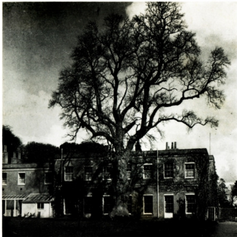
KILLERTON : HALL OF RESIDENCE

d. Students training to teach Science should gain a basic knowledge of Physics, Chemistry and Biology. They may then specialise in two or three of these subjects.