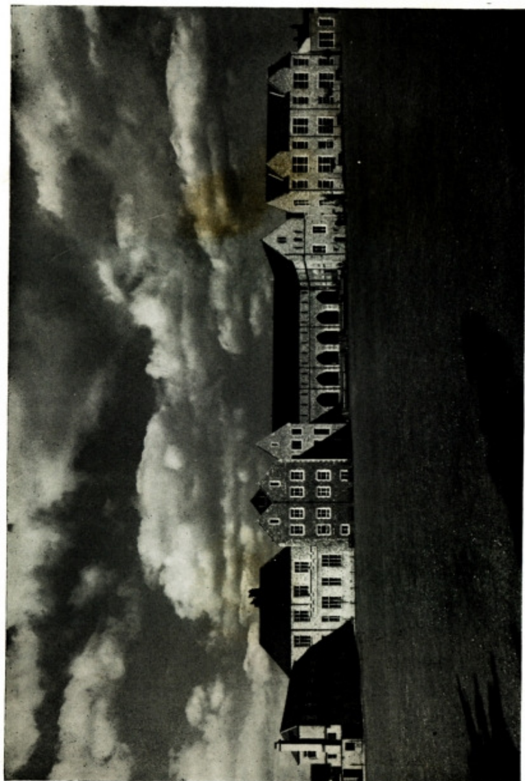
THE COLLEGE FROM THE CRICKET FIELD